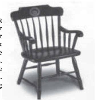
BACS Academic Chair Order Form

A beautiful wooden armchair or rocking chair would make a wonderful gift or an elegant addition to your office or study. Both styles of chair are black enamel with cherry stained arms. The BACS seal decorates the chair back. Order from the Choir School and the chair will be shipped directly to you. The cost of $375.00 includes shipping and handling.