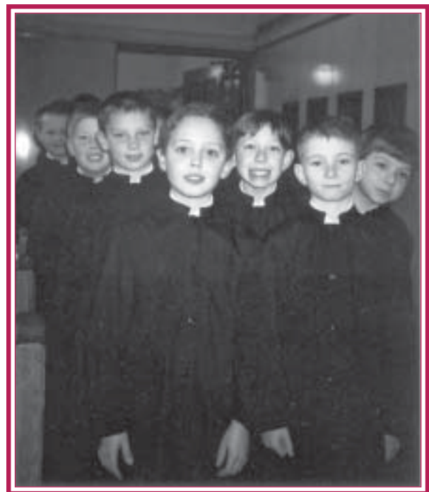
Members of the Class of 2008 before Investiture